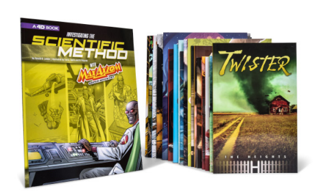
Sample Fluency Library, Grades 6-8

The optional Hi/Lo Fluency Libraries put engaging, age-appropriate books in students' hands to give them the reading practice they need to build fluency, increase automaticity, and boost confidence. Each grade-level collection includes 20 fiction and nonfiction trade books that were selected for the characteristics of decodability taught in SIPPS Plus. These collections ease the important transition from decodable text to trade books.