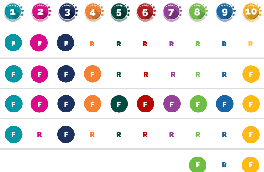
Chart Key: F Unit Focus R Reinforced